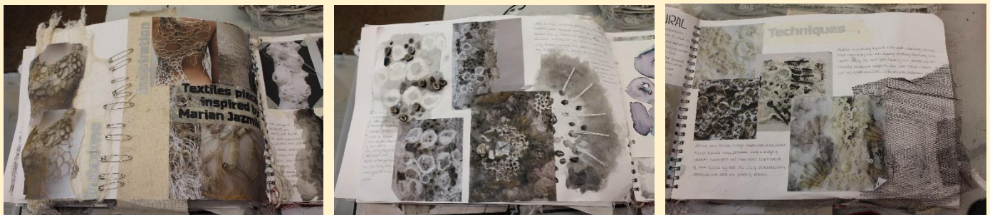
Examples of students artist research pages

Task 2b) Create your own artist's research page(s) on Marian Jazmik on paper or card (no bigger than A3 so that you can put it in your new sketchbook in September) Include a creatively presented title, information about the artist, information on her work, photos of her work and your own sketches and experiments inspired by her work. Look closely at the colours and textures she uses and try to emulate these in your research page.